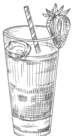
Brussels Mussels Spritz